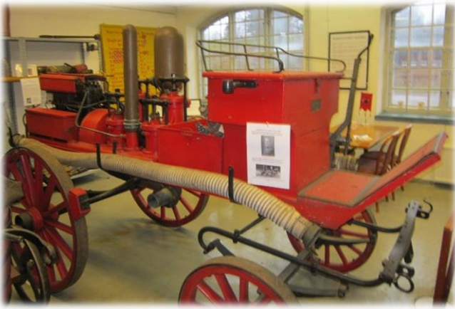
Horsedrawn motor pump