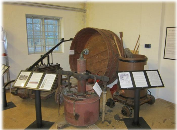
Bucks and pumps.