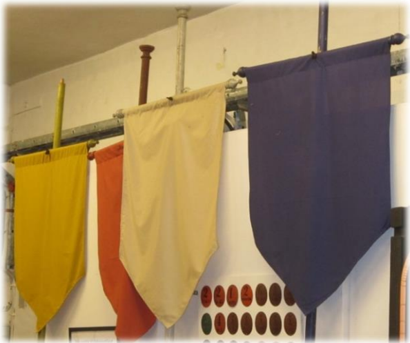
Flags for Groups.