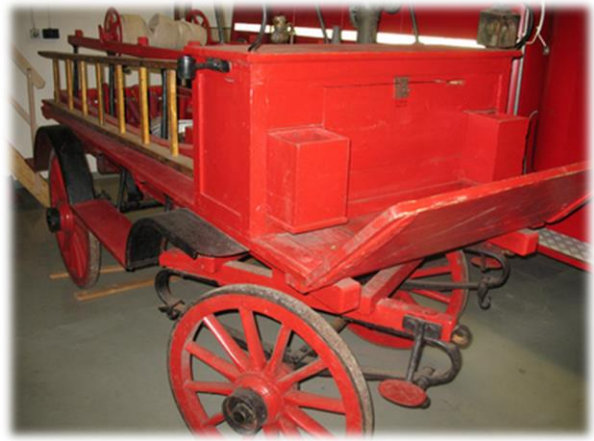
Wagon for tools