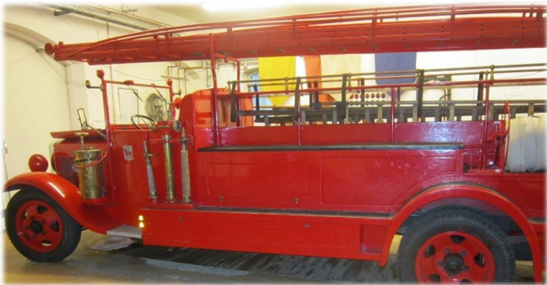
Fire truck Volvo 1934