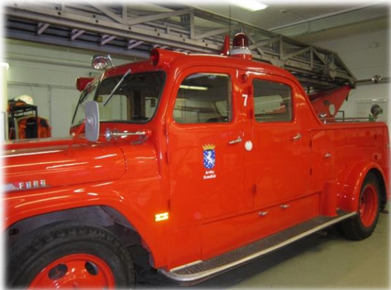
Fire ladder (Ford 1957)