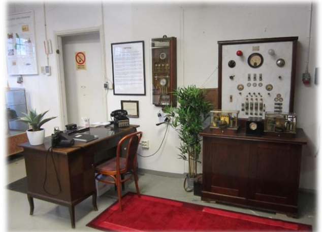
Fire Alarm centers