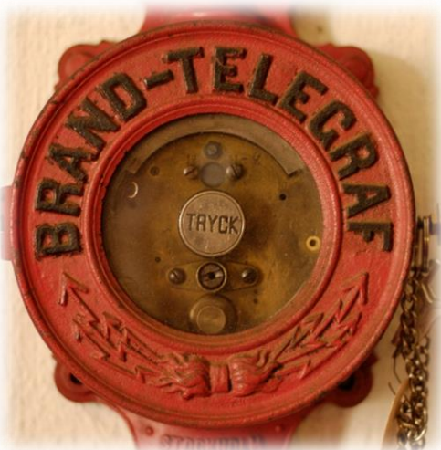
Public Fire alarm button