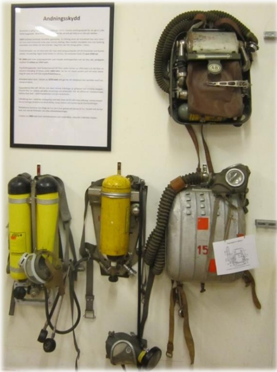
From oxygen to compressed air.